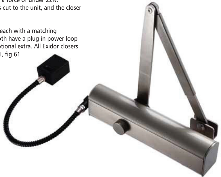
4870 B slide