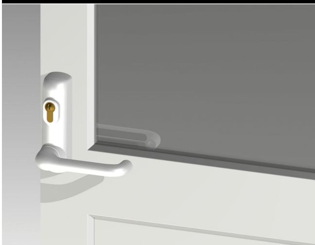
Outside Access Devices